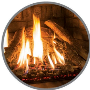
ULTRA HIGH DEFINITION LOG SET