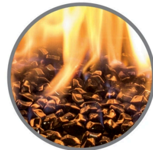
GLASS BURNER WITH DIAMOND GLASS

Available for E20, E30, EX32, E33, EX35, & E44