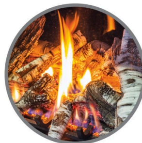
BIRCH LOG SET