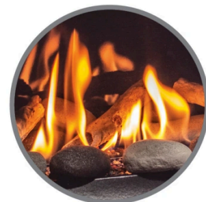
RIVER ROCK SET