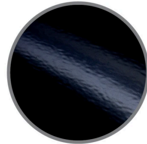
BLACK ENAMELED STEEL LINER

Available for E30, EX32, E33, EX35, E44, & Ri30