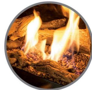
DRIFTWOOD LOG SET

Available for E25, E30, E33, E44, & Ri30