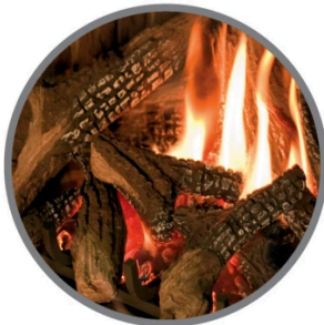
CLASSIC LOG SET